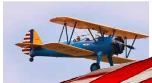
Photos of planes, pilot, & parachuter on this page used with permission from Gynzer Photography